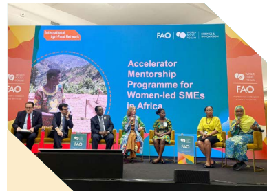
FAO-IAFN SME Accelerator Programme Launch