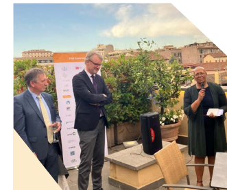
CFS Chair giving her opening remarks during the AGM reception

Food and nutritional security is closely connected with economic growth and social progress.