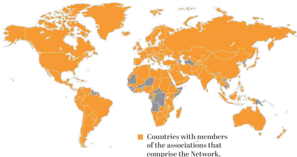
■ Countries with members of the associations that comprise the Network.