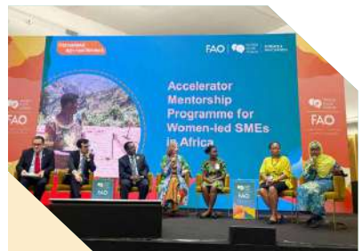
FAO-IAFN SME Accelerator Programme Launch