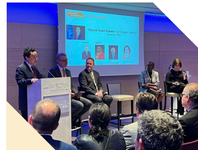
DG Qu Dongyu speaking at the Partnering 4 Betters event