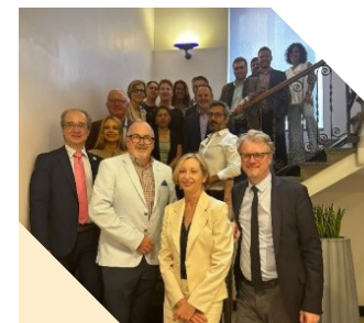
IAFN Members at the Annual General Meeting