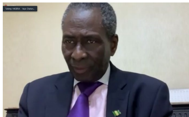
H.E. Yaya Olaitan Olaniran, Minister and Permanent Representative of Nigeria to the FAO