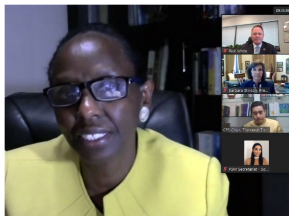
Dr. Agnes Kalibata, Special Envoy of the UN Secretary-General, 2021 Food Systems Summit